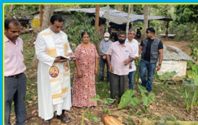
Inauguration at Hattihole and Siddapura