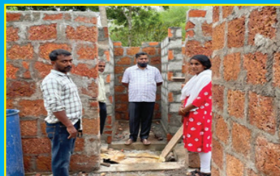
Monitoring visit by the committee members