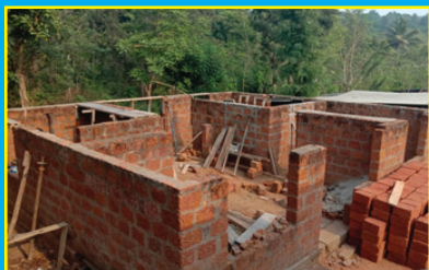
House construction work in progress