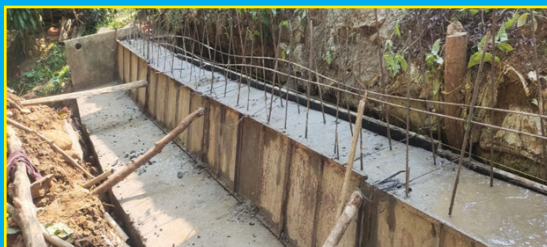
Earth work at Hattihole : Retain wall